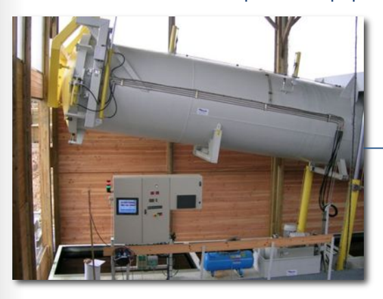
Touch panel is used for selection of user program and cycle start, along with cycle watch and maintenance functions. Cycle data recording using a networked desktop PC is available as an option.