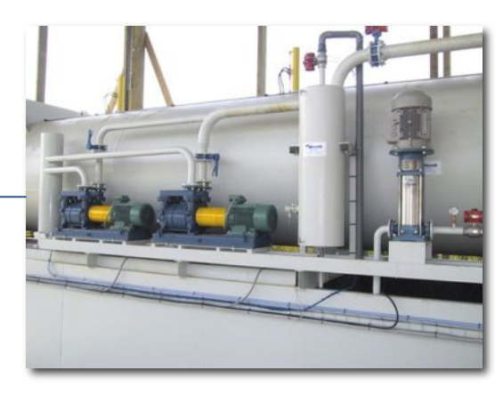
Assisted loading is available, with manual or automatic controls.

It uses a preprogrammed Bethell cycle, or custom programs adapted to your needs.