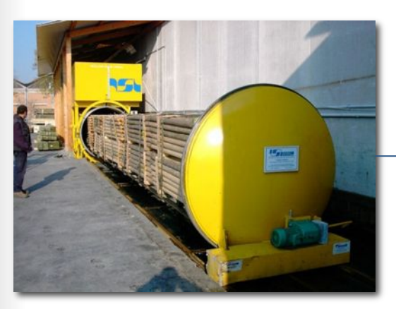
Vacuum and pressure phases are reached quickly, using powerful pumps to save time on cycle transitions.

vacuum & pressure vessel for wood treatment