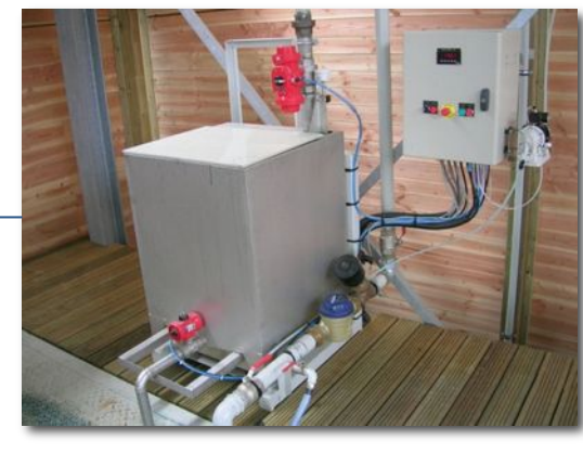
Tilting of vessel during final vacuum reduces draining time, increases the quantity of chemical return to the service tank, and keeps the draining area cleaner.